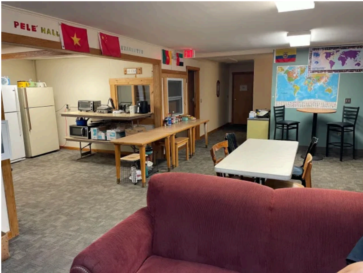
Boys' upstairs lounge with kitchen