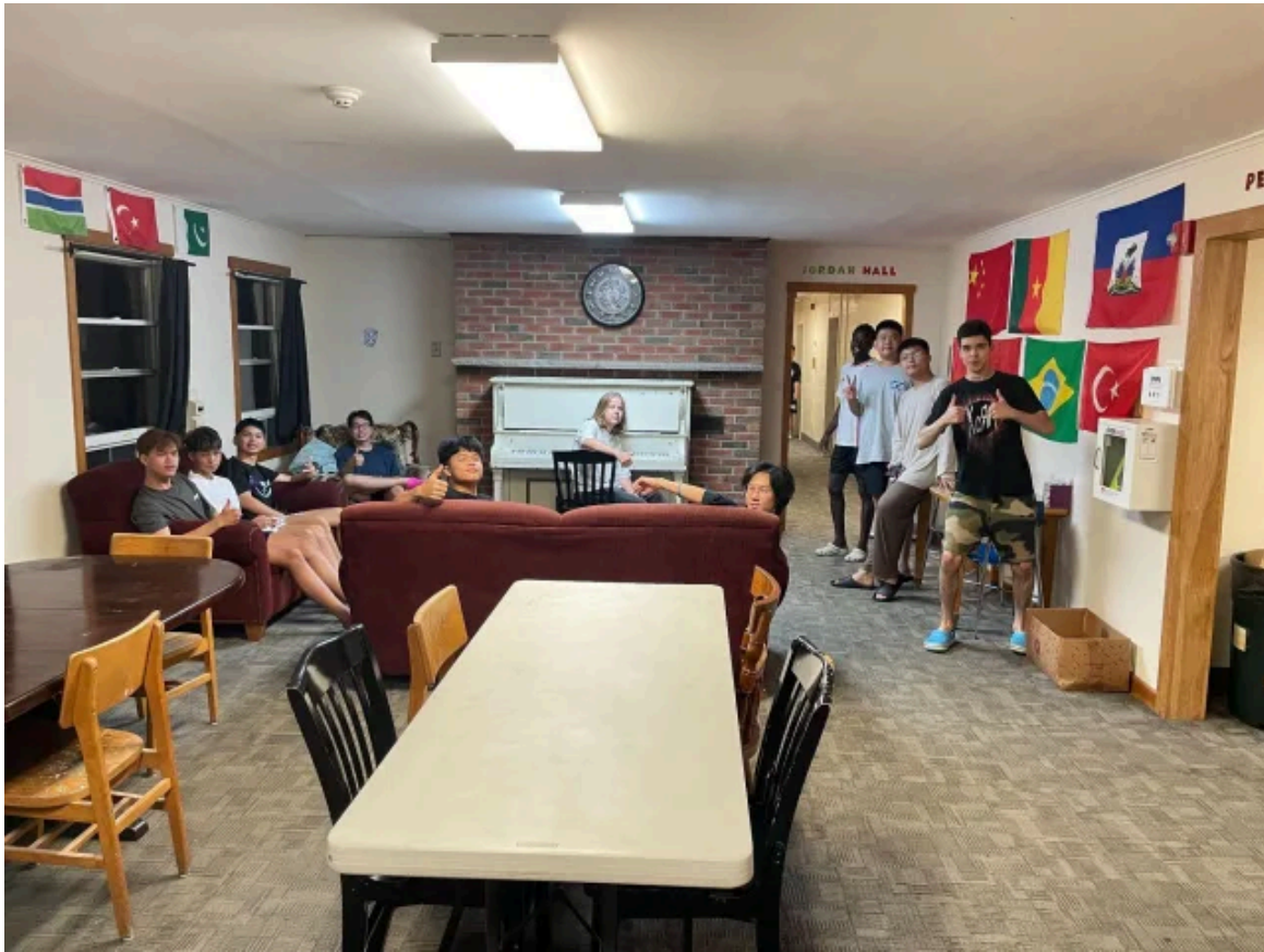
Boys' Dorm lounge