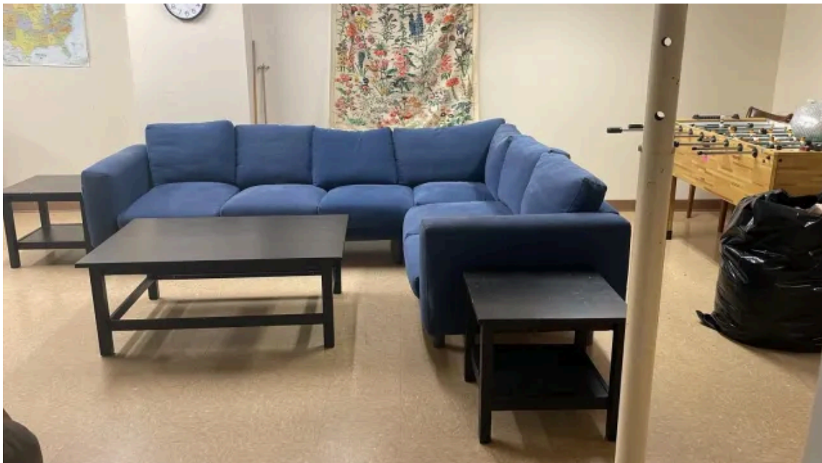
Girls' dorm lounge