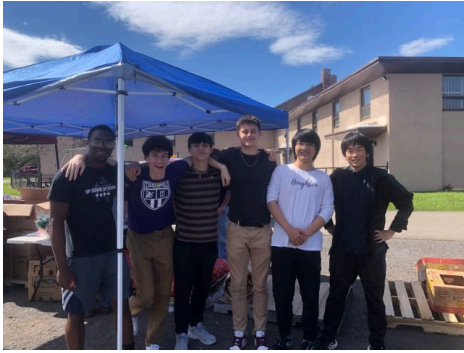
Houghton Academy Student Council came out to support Accord's local food distribution. Many hands make light work.