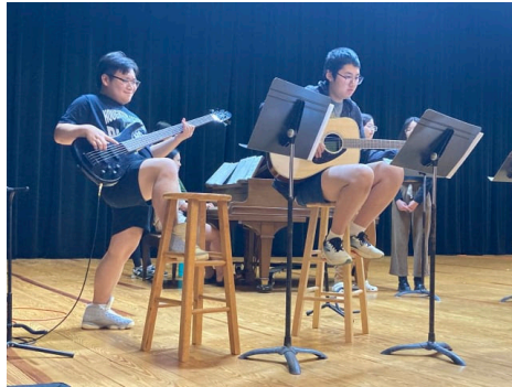
Members of the HA Worship Team in rehearsal as they prepare for the May 22 Night of Praise!