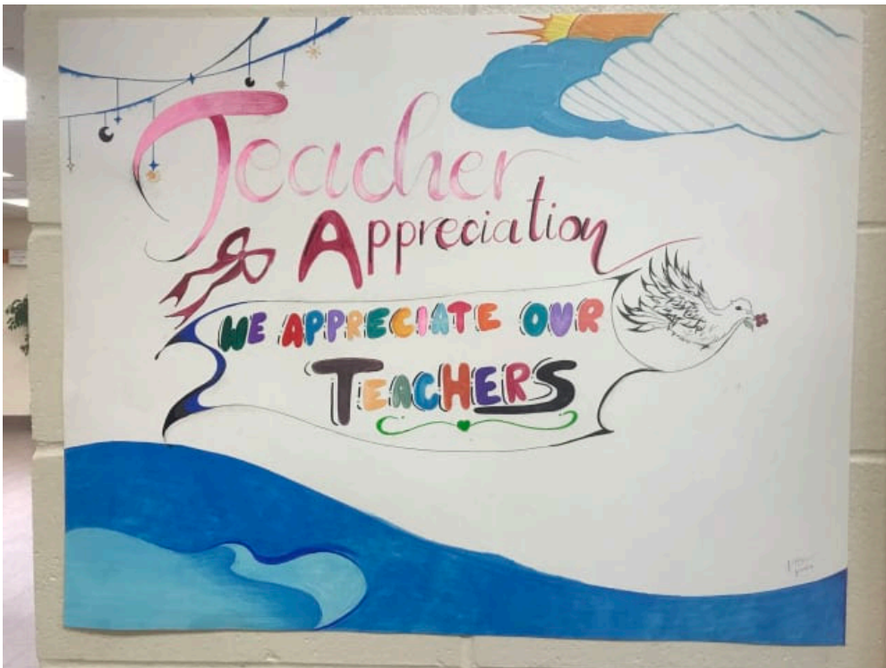
Art work and poster by one of our students, celebrating and honoring our teachers for Faculty/Staff Appreciation Week.